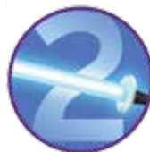
2 Year Lamp