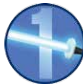
1 Year Lamp